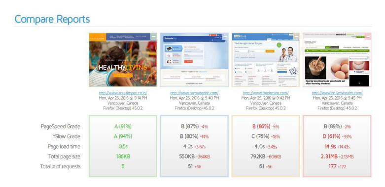
Fig 5: Comparison Report (AJAX Vs Traditional Web Applications)

As seen from above table, proposed system is compared against other web applications, on five different parameters. The proposed system has fastest loadingspeed, hence least load time, its Yslow grade is 94%, which is best in the category and only 5 request has to be made to load a page which is also very much less that other web applications.