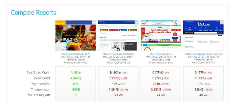
Fig 4: Comparison Report (AJAX Vs Traditional Web Applications)

Comparative results are examine by using some non-Ajax based web applications. We compare our web application with three non Ajax based applications and also with some Ajax based applications and calculate some results. As seen in following figure 5 and figure 6, it shows the loading speed required by each web application. The size of the page, internet speed of the user computer and loading time of the page on the user's computer is take in consideration while calculating the speed. How faster the webpage respond to user interaction and the loading time required for web pages is also calculated.