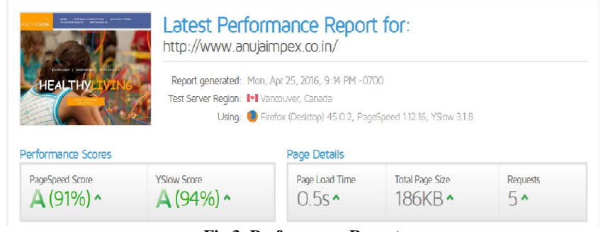
Fig 3: Performance Report

To find out the performance of our web application we use some trustable tools via internet. Results show the improvement of application with different extends like page speed, number of request required to fetch page, loading time, size of page. This results are shown in following figure.