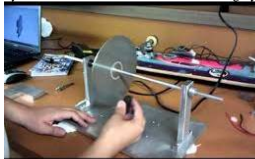
Images of Eddy Current Braking System Fig 3 Shows

Electromagnetic induction is the principle behind eddy current embedded conventional braking system. Eddy current brakes make use of opposing tendency of eddy currents. Eddy current embedded conventional braking system is a merging of eddy current brake and conventional brake. These brakes have been used in trains and roller coasters successfully. So far no ideas had been that much effective in implementing the eddy current embedded conventional braking system in automobiles. “Eddy Current Embedded Conventional Braking System” is the only way to solve this.