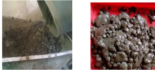
Fig. 2 Fresh concrete of UHPC

Fig. 2 shows the freshly prepared UHPC as shown below.