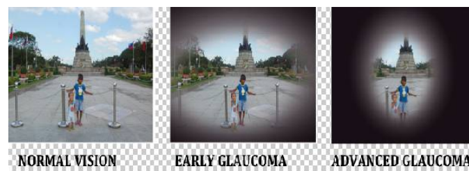
Figure 2: Schematic view of an image at different stages of vision

Different views of same image is represented in figure 2. Main reasons for glaucoma are old age, diabetes, eye injuries, myopia, Corticosteroids, migraine, etc... There exist many methods to detect glaucoma like Heidelberg Retinal Tomography (HRT), Scanning Laser Polarimetry (SLP) and Optical Coherence Tomography (OCT). All these methods assess optic nerve. Optical Coherence Tomography (OCT) is a non-invasive imaging test that use light waves to take the cross-section pictures of your retina. With OCT the distinctive layers of retina can be seen. It helps to map and measure their thickness. This measure helps to diagnose glaucoma. Scanning Laser Polarimetry (SLP) use polarized light to measure the thickness of retinal nerve fiber layer as part of glaucoma workup. Heidelberg Retinal Tomography (HRT) is a procedure used for the diagnosis and management of glaucoma by precisely observing and documenting the optic nerve head. The Heidelberg Retinal Tomography uses a special laser (that will not affect the eye) to capture 3 dimensional photographs of the optic nerve and surrounding retina. This laser is mainly focused on the surface of the optic nerve and captures the image. But these methods are very expensive and need expert clinicians. Because of that automated diagnosis became important.