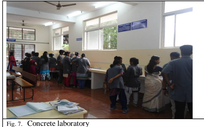
Fig. 7. Concrete laboratory