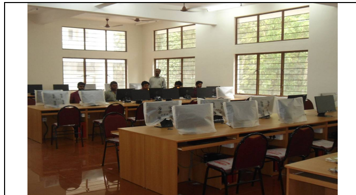
Fig. 3. Civil Engineering Drafting laboratory

on large computer tables specially made to accommodate many a students on either side of the oblong tables aligned in rows.