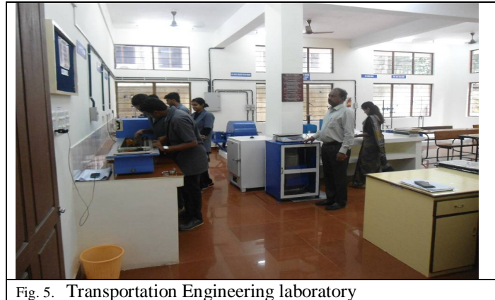
Fig. 5. Transportation Engineering laboratory