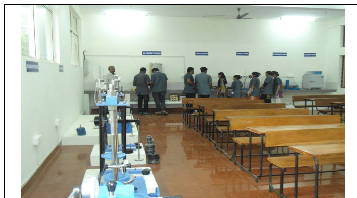
Fig. 4. Geotechnical Engineering laboratory

The GT Lab is arranged in a spacious hall large enough to accommodate thirty five to forty students in a single session (Fig. 4). Machines are arranged in a single row having enough space in between. The Lab hall is well ventilated and has large windows providing ample day light. A large permanent work bench is provided to carry out table top experiments and a working platform is arranged to carry out experiment like the CBR test. The machines are so aligned that every work station is easily observed from the faculty seat. This lab is equipped with various soil testing equipments like “Direct shear test apparatus”, “soil consolidation test apparatus”, “Proctor compaction test apparatus”, “Unconfined compression testing machine”, Soil permeability testing machine” “Hot air oven” etc.