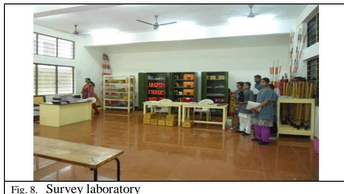
Fig. 8. Survey laboratory

The survey laboratory is well maintained with periodic maintenance. The equipments that are exposed to moisture when survey practical are conducted during wet conditions are subjected to immediate maintenance to avoid fogging of the lenses. As a part of 7 th semester subject “Survey Camp, Seminar”, students prepared a map of the college campus including elevations. This will also enable a rainwater harvesting scheme to be prepared for the campus. This lab is provided with modern survey equipments like Total station, Digital Theodolite, hand held GPS, digital leveling Instrument etc.