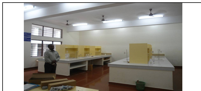
Fig. 2. Design of Environmental Engineering laboratory providing full monitoring of student at all times ensuring their safety

The EE lab has two permanent work tables with ceramic tiled top (Fig. 2). These are large enough to carry out twelve titrations at a time. Each table has three test booths on either side with side wash and independent storage shelves. At a time up to forty students can do practical here. The Lab hall is well ventilated and has large windows to attract day light. A side work bench is there with enough storage space. This lab is equipped with "Nephelo Turbidity meter", "Visible Spectrophotometer", "Hot air oven", "pHmeter", "magnetic stirrer with hot plate" and very precise measuring balances. All these equipments are provided with hassle free power supply from UPS.