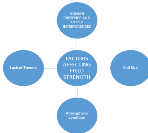
Fig. 1: Factors affecting signal strength

5. Lack of Towers: Cellphone carriers are supposed to reduce the distance of the cell phone towers and the Cell phones to a bare minimum to keep the cell size low. Larger cell sizes require the carriers to transmit a higher signal strength which can have several economic and health related repercussions. The cell towers are often placed in a honey comb design to provide a perfect coverage in a particular area. When you move out of a cell the signal is handed over to the neighboring cells to make mobile communication possible. This can be a problem with the lack of adequate towers placed in rural areas[4].