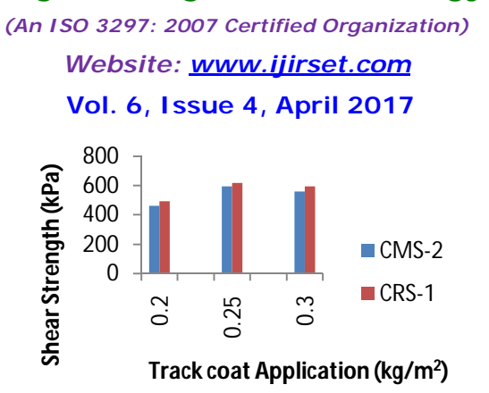
Figure: Plot of Shear Strength v/s Tack Coat application rates for 150 mm diameter specimens using Shear testing model no. 2.