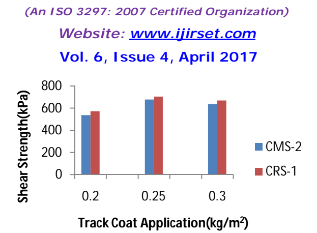
Figure: Plot of Shear Strength v/s Tack Coat application rates for 150 mm diameter specimens using Shear testing model no. 3.