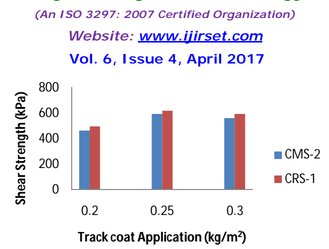
Figure : Average Shear Strength v/s Application rates for the three models.

The average maximum shear strength was observed on specimens with CRS-1 as tack coat at an application rate of 0.25 kg/m2 while the specimens with CMS-2 at an application rate of 0.20 kg/m2 showed the average minimum shear strength as shown in figure 4.5. Using CMS- 2 as tack coat the average shear strength values were obtained as 462.059, 593.435 and 558.772 kPa at application rates of 0.20 kg/m2, 0.25 kg/m2 and 0.30 kg/m2 respectively. Similarly using CRS-1 as tack coat at application rates of 0.20 kg/m2, 0.25 kg/m2 and 0.30 kg/m2 the average shear strength values obtained were 494.740, 618.424 and 592.921 kPa respectively.