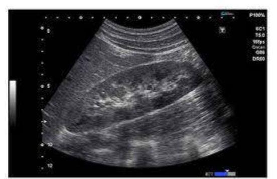
Fig: 1: ultrasound image corrupted by the speckle noise

Medical images are often deteriorated by noise due to various sources of interferences and other phenomena that affect the measurement processes in imaging and acquisition system. Speckle noise occurrence is often undesirable, since it affects the tasks of human interpretation and diagnosis. It is used for imaging soft tissues in organs like spleen, uterus, liver, heart, kidney, brain etc. gnosis. On the other hand, its texture carries important information about the tissue being imaged. This paper to developing in the Kidney images.