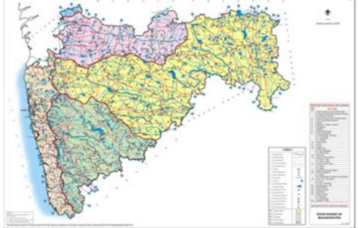
Fig. 2.River Map of Maharashtra

(An ISO 3297: 2007 Certified Organization) Website: <u>www.ijirset.com</u> Vol. 6, Issue 4, April 2017