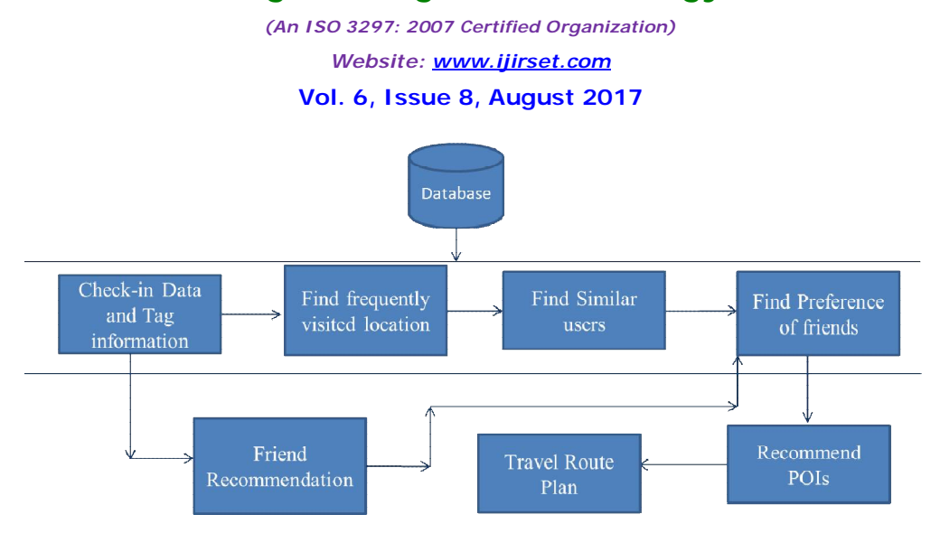
Fig 1. System Architecture

As per system architecture, user registers to the web application and login. User can check-in at current location and upload his visiting location details and photo. Based on use current location and user preferences, the system recommends POIs to the user. While recommending POIs friend's preferences are also considered. If user wants to plan one day trip, the system will generate a route i.e. a sequence in which the POIs can be visited.