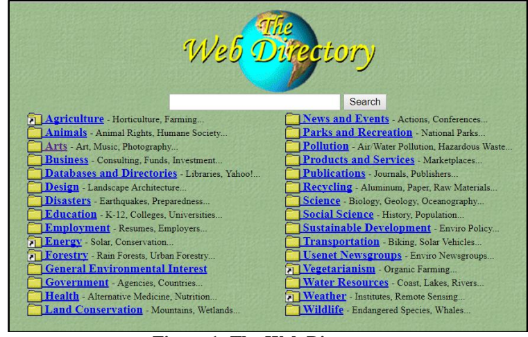
Figure 1: The Web Directory

A web directory is a listing of websites organized in a hierarchy of interconnected list of categories and subdirectories which is usually maintained by humans. A Web directory is also known as link directory. Unlike, the search engine database automatically gathered the links or entries by web crawlers, most of the web directories are created and maintained manually. There are two ways to find information on the web namely searching or browsing. Web directories provide links in a structure form which leads to make browsing easier. With the help of the search engine, many web directories combine searching and browsing to search the directory. The datasets are collected from the web directory for classifying the web pages. Figure 1 shows the web directory [10].