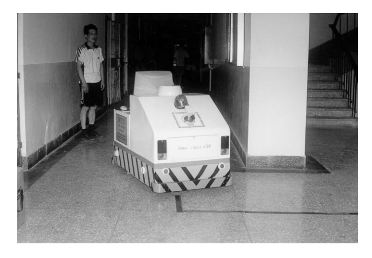
Figure Tainjin Institute of Technology's TUT-1 intelligent robot.

shown in Figure and described by Cao8 in this proceedings. This intelligent robot can be guided using overhead lights using an omnidirectional vision system.