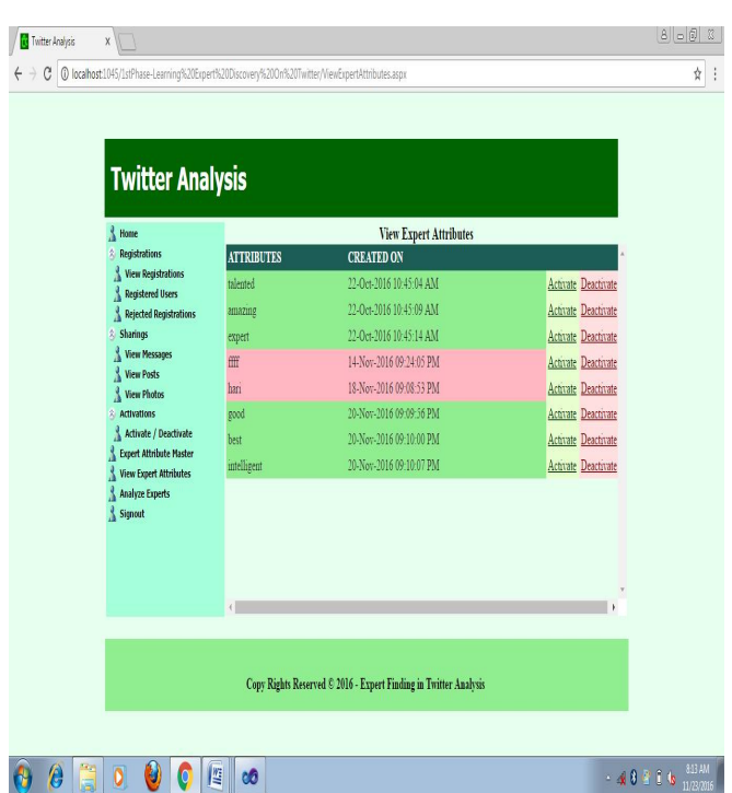
Fig.7. View Expert Attribute Terms