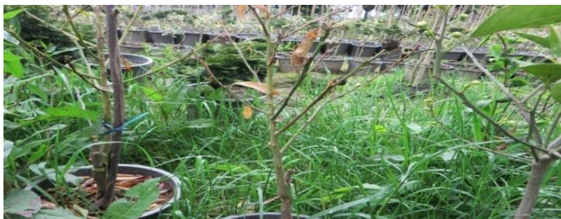
Figure 2. Drying kumquat tree due to Phytophthora citrophthora fungus