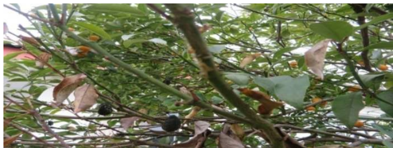
Figure 3. Dry and dead kumquat branches