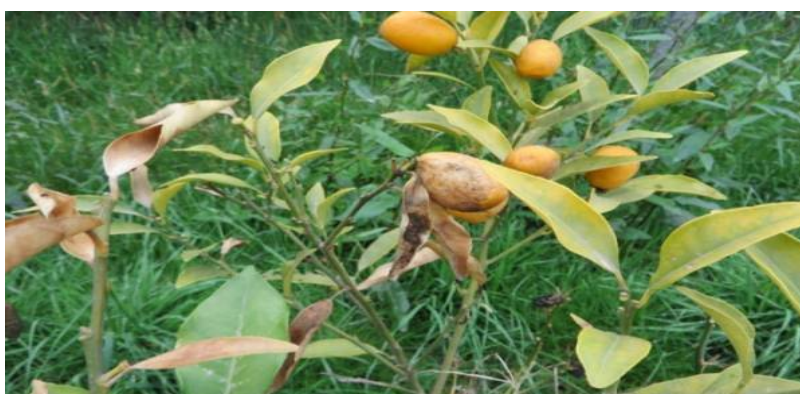
Figure 4. A Kumquat fruit brown rot