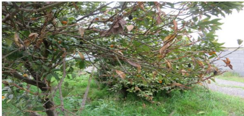
Figure 6. A kumquat tree suffered from a serious Phytophthora disease induced citrophthora .