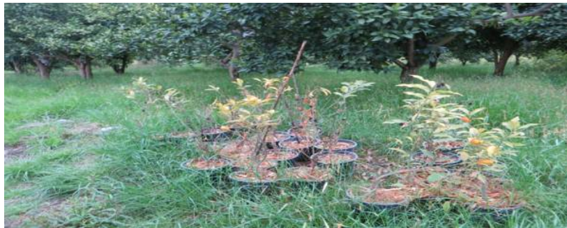
Figure1. Change the color of leaves, leaf loss and canker branch