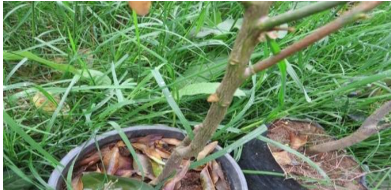
Figure 5. Gum secretion on the skin surface in infected kumquat trees and branch burn