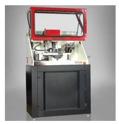
Figure 1: Working Machine XL Mill

Working Machine: For the experiments XL CNC Machine is used