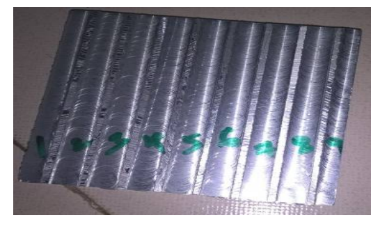
Figure 1 Work piece 6463 Aluminium Alloy

Work piece material: The experiment is carried out on 6463aluminum alloy and brass materials ( 100 \times 95 \times 10 \text{ mm} ) and ( 160 \times 75 \times 10 \text{ mm} ) 9 blocks.