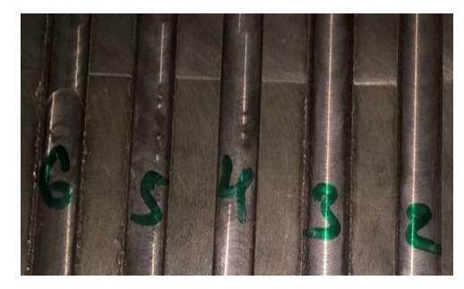
Figure 3 Work piece Brass

Surface Roughness Tester: Taylor Hobson Surface tester is used for taking Ra values. It contains a probe which is movable. By some force this probe is moved on surface of work piece.