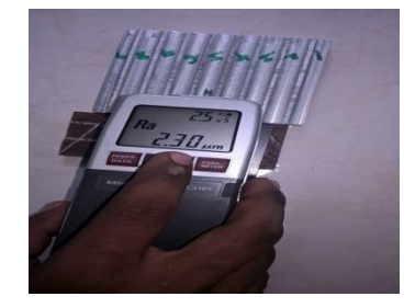
Figure 4: Surface roughness tester (Talysurf)

(An ISO 3297: 2007 Certified Organization) Website: <u>www.ijirset.com</u> Vol. 6, Issue 2, February 2017