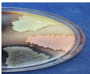
Fig. 1 shows the image of effect of sunlight on bacterial isolates Pseudomonas guezenei (dark brown), Clostridium tertium (light brown) and Kocuria flava .(faint yellow)

Figures shows the results of effect of sunlight on different bacteria as well as fungi. Fig. 1 shows the image of effect of sunlight on bacterial isolates Pseudomonas guezenei , Clostridium tertium and Kocuria flava . Fig. 2 (a), (b) and (c) shows images of effect of sunlight on fungal isolates Aspergillus niger , Aspergillus fumigatus and Botryosphaeria rhodina respectively.