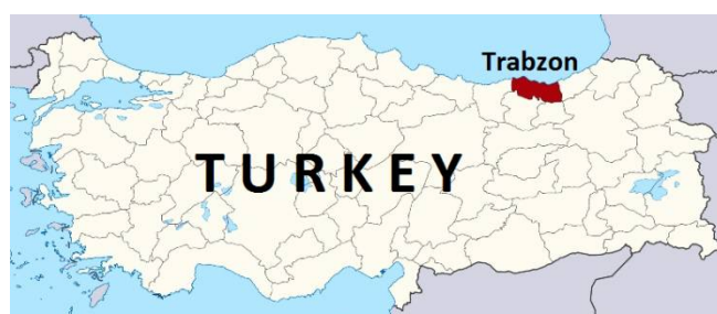
Figure 1. General Outlook of Study Area

This study was conducted in the forest nursery of Trabzon-Of (40°58'39"-40°59'03" N, 40°19'34"-40°20'19" E). General outlook of study area was presented in Figure 1. The Trabzon-Of forest nursery is 5 meters high from sea level, facing to the South, with a surface area of 242,04 ha. This forest nursery has a production capacity of 2.468.0420 piece/year.