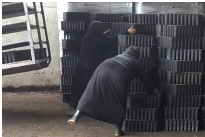
Figure 2. Loading pots on to tractors

This study examined the works of loading the empty polyethylene pots on to tractors and loading the saplings ready to sell on to trucks in the Trabzon-Of forest nursery. First, we recorded both works from beginning to end, then analyzed the records to determine the work processes and working posture types of workers. We observed that during these works workers displayed working postures such as bending down and stretching, lifting, carrying, lifting up and stretching. As shown in Figure 2, when loading polyethylene pots on to tractors, pots piled on the ground on top of another were taken from different heights at every time and put on to the shelves of the cabinet on the tractor-trailer at different heights. Research and observations have shown that workers displayed 18 different working postures until the work is concluded as pots were taken from different heights and placed on to different heights.