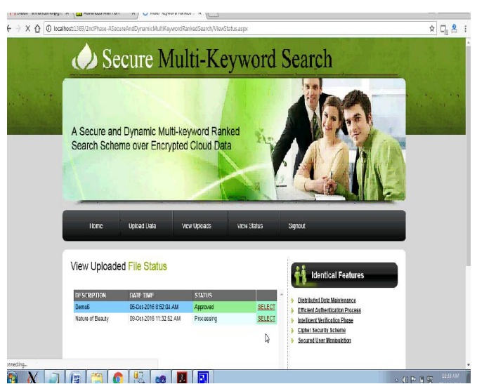
Fig.3 View File Status

Website: <u>www.ijirset.com</u> Vol. 6, Issue 2, February 2017