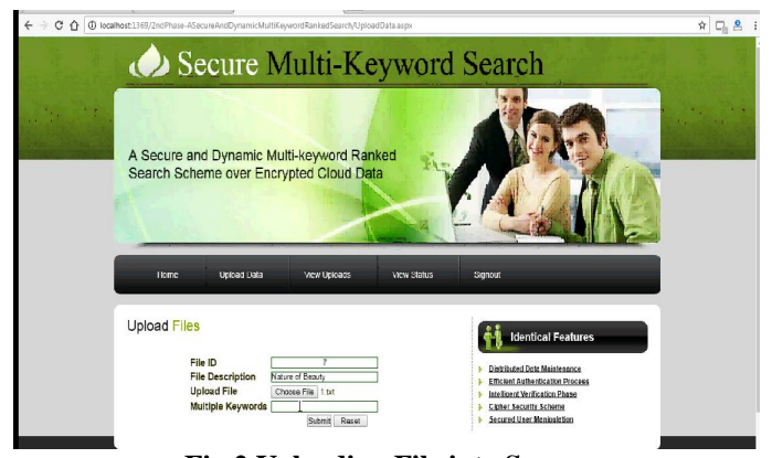
Fig.2 Uploading File into Server