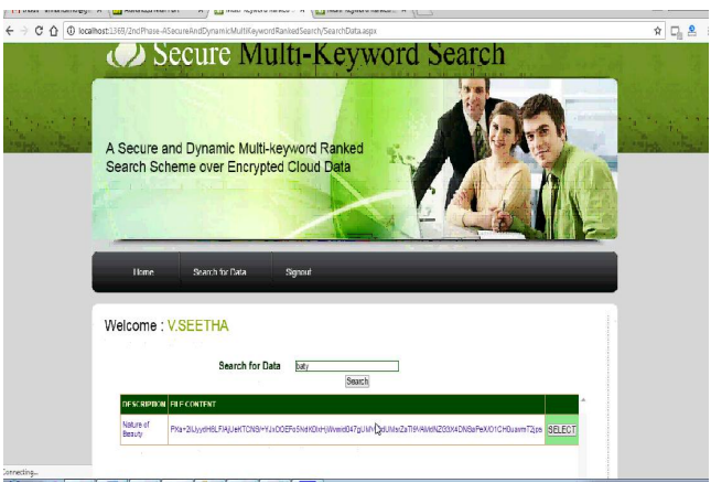
Fig.4 Search for Data