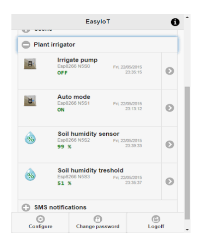
Figure 4: Android Application for HAS

The android application is the mobile operating system installed in the user smart phone. A remote user can monitor and control the home appliances from its android application and communication is done via locally or remotely. When the threshold value of the sensor reaches maximum level the android application for smart home automation system instantly alerts the user to remotely monitor the home appliances. An android platform is used as it has a huge market and cost effective due to the open source. Besides that, android development application tools are free to download and provide flexibility to developers to easily edit and extend the source code.