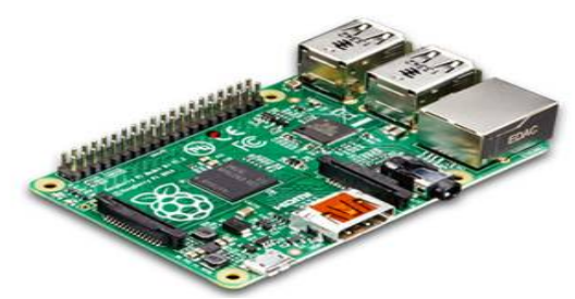
Figure 3: Raspberry Pi Model B

The Raspberry Pi is a credit-card-sized single-board computer developed in the UK by the Raspberry Pi Foundation with the intention of promoting the teaching of basic computer science in schools. The Raspberry Pi has a Broadcom BCM2835 system on a chip (SoC), which includes an ARM1176JZF-S 700 MHz, Video Core IV GPU, and was originally shipped with 256 megabytes of RAM, later upgraded to 512 MB. It does not include a built-in hard disk or solid-state drive, but uses an SD card for booting and long-term storage.