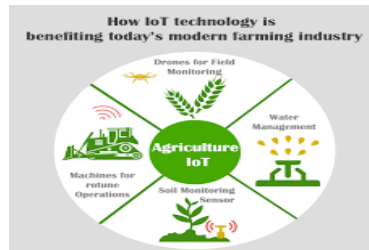
Fig 2. Agriculture and IoT