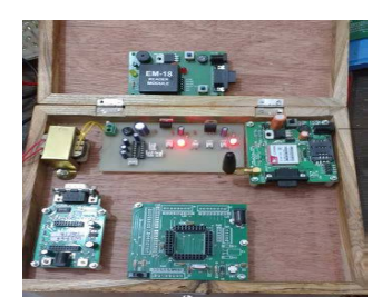
Fig 2:- Hardware of proposed Model