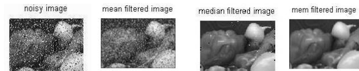
Figure 1: Image filtered using the Mean, Median and Mean-Median filter.

Mean - Median Filter [10] is a combination of sample mean and sample median. Figure 1 shows the performance of Mean - Median tested against Mean Filter and the Median filter on a standard onion.png for analysis. The images are corrupted with various levels of impulse noise ratio. The significant difference in mean square error (MSE) and Peak signal to noise ratio (PSNR) with other mean and median filters quantifies the superiority of the Mean - Median filter. From the analysis it is very clear that Mean – Median Filter performs well on low level impulse noise levels to very high level impulse noise levels. . Median filters are known for their capability to remove impulse noise as well as preserve the edges. The main drawback of a Standard Median Filter (SMF) is that it is effective only for low noise densities. At high noise densities, SMFs often exhibit blurring for large window sizes and insufficient noise suppression for small window sizes [8] [9].