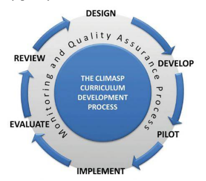
Fig.1 The CLIMASP Curriculum Development Process [12]

The number of courses to be taken by undergraduate students, including the capstone course to qualify for the CLIMASP minor are weighted 60 ECTS. Students will be provided a formal credential through transcript documentation (Euro-Arabpass) adapting the Europass diploma to certify that they have developed leadership in the field of climate change and sustainability policy [10], [11].