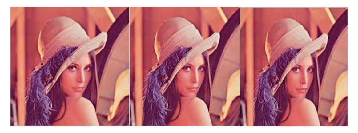
Figure 2: (a) Original Image 'Lena'; reconstructed image (8×8 block) using (b) BTC, (c) MBTC