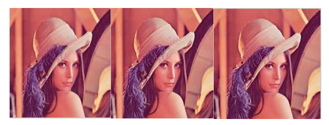
Figure 1: (a) Original Image 'Lena'; reconstructed image (4×4 block) using (b) BTC, (c) MBTC

Website: <u>www.ijirset.com</u> Vol. 6, Issue 1, January 2017