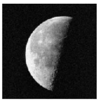
Noisy Image Figure 2: Moon with noise variance .01