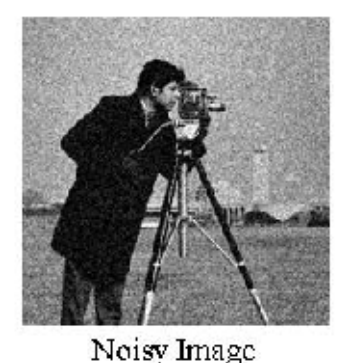
Figure 1: Cameraman with noise variance .01