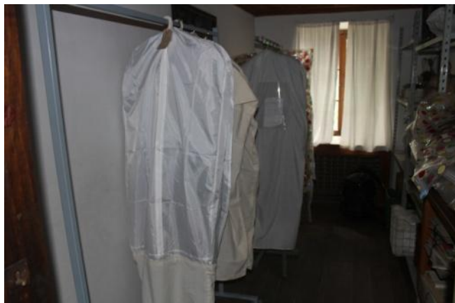
Figure 5. Putting in order the storage space

Figure 5 demonstrated the work done for storing the costumes and textiles in an appropriate way.