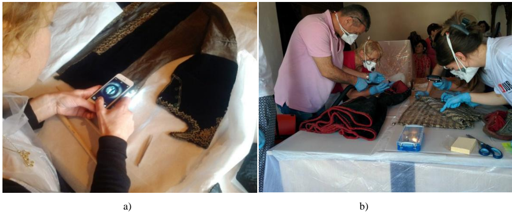
Figure 2. Pest activity identification

Figure 2 (a, b) shows the identification and the evidence of pest activity waist coat and apron. The evidence of pest activity, the vacuum-cleaner bags were removed after each use, sealed in a polythene bag and disposed of with a range of nozzles and soft brushes.