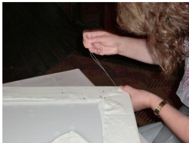
Figure 3. Covering the mount

The first stage of restoration of- that fabrics - was then complete. It remained to restore the original shape of the garments by constructing a hooped petticoat (farthingale). This entailed an elaborate research process. Participants that worked on the exhibition were responsible for conservation of and organizing the objects that are showcased at the museum, preparing the exhibition mount, which prevents the object to come in contact with the wall, and their correct exhibition.