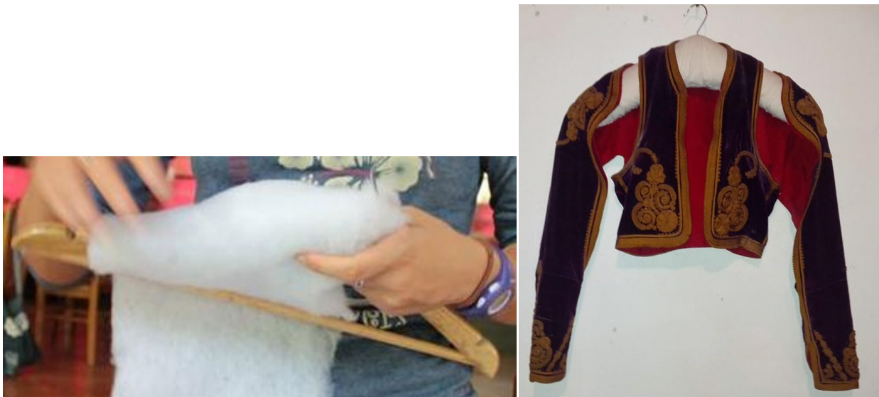
Figure 4. A padded hanger for costumes

Place layers of Dust polyester wadding over the hanger, padding it to the same width as the shoulders of the garment. The hanger should be padded to suit the shape of the garment; for example, if the garment has sloping shoulders make the padding to match. The Dust may need to be hand-stitched to hold it in place.