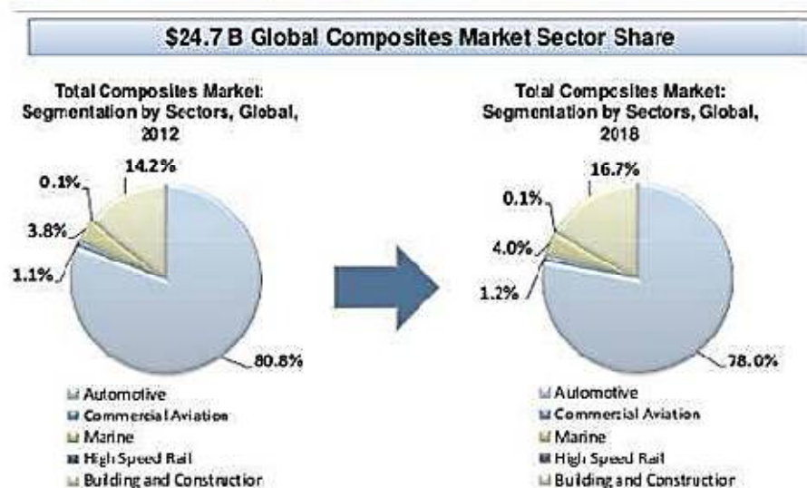
Figure 1. Sector-Wise Composite Demand