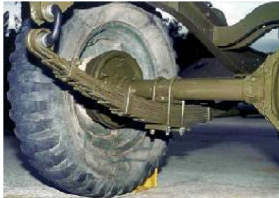
Figure 1: Leaf spring assembled at rear axle of automotive[2]