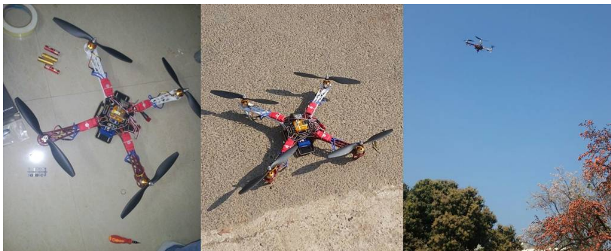
Fig. 1. Quadcopter developed in IDEA LAB of VSSUT, Burla and a test run

A self-made unmanned aerial vehicle (quad copter) is used for the purpose this thesis. The Drone was assembled in the IDEA LAB of VSSUT, Burla. A maxx 4k 16mp ultra HD Wifi action camera was used for taking aerial images, with a significant overlap ratio of 80%. A brushless camera gimbal with motor controller is used for holding the camera in UAV and to operate it. A Mini Ublox 7M GPS module is used to get the exact coordinate of the drone. An Altimeter is used to measure the height of flight of the drone. The Quadcopter was deployed over the site to be mapped, and the pictures were received from the aerial analysis. Primarily Agisoft software was used to process the images to get the 3d maps.