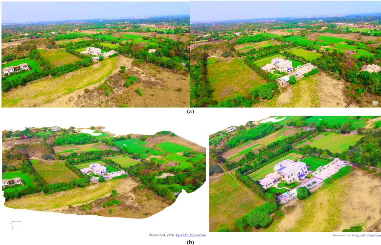
Fig.3 Data Acquisition and processing (a) Original Raw Images taken by drone (b) 3d Map rendered in Agisoft