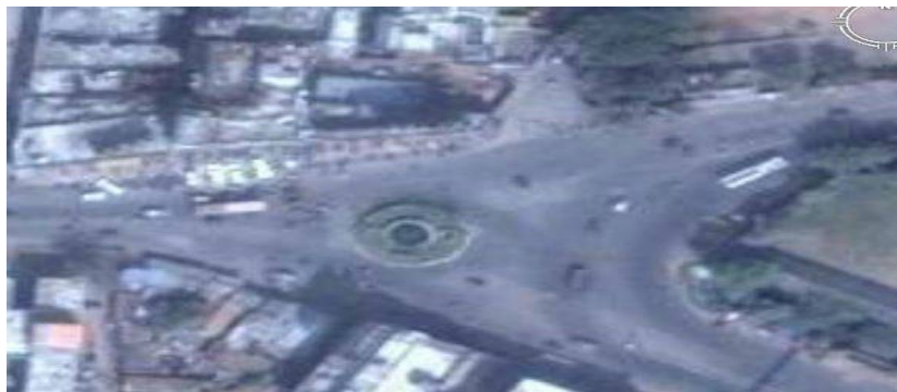
Figure 2 Typical Layout of Gitabhavan Junction in Kurnool City

Figure 1 shows the aerial view of Kaman junction at Kurnool City; Surveys were carried out to get the reliable data at this intersection consisting of heterogeneous traffic. Different modes of traffic such as Buses, Trucks, cars, auto rickshaws, cycles and low commercial vehicles etc ply on these roads.