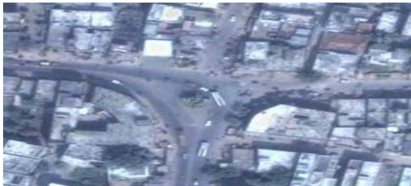
Figure 1 Typical Layout of Kurnool Junction in Kurnool City

Typical maps of the roundabout are shown in the figure 1 and figure 2 respectively.