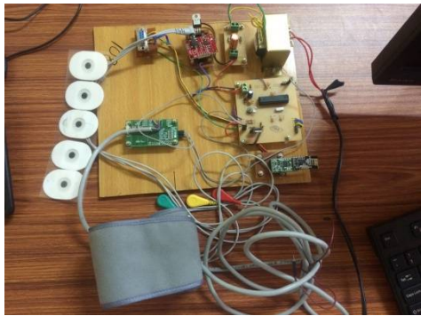
Fig.3. Hardware of health monitoring part

The hardware of health monitoring section is shown in Figure 3. The three sensors, ECG, Blood pressure sensor and heartbeat sensor serially connected to the microcontroller. The values of three sensors are sends to the medicine box through the RF data modem.