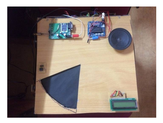
Fig.4. Hardware of medicine box

The hardware of medicine box is shown in figure 4. It consists of microcontroller unit, GSM module, APR module etc. The system checks patient's EEPROM card and if it is valid, the system starts to operate and LCD displayed a message "VALID CARD". Then it displayed information related to the patient like name, sensor values. This message also showed when security card is put on the reader.