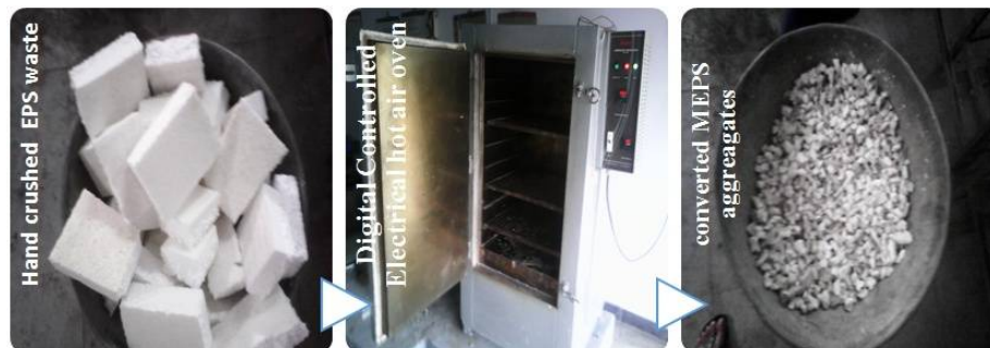
Figure: 3 Processing Of Waste EPS by Heat Treatment