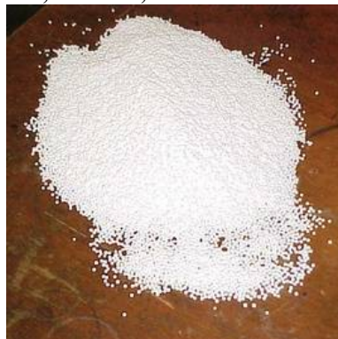
Figure 6: MEPS fine aggregates