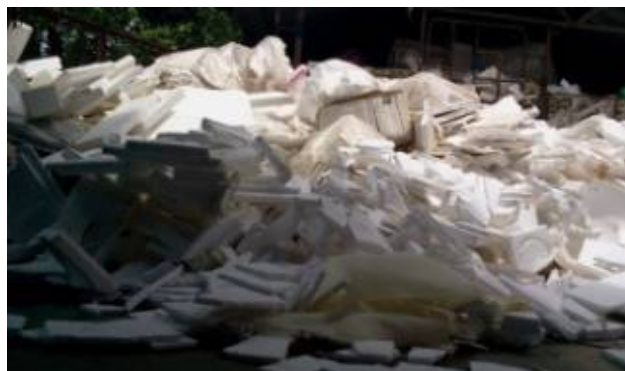
Figure 2: waste EPS dumped in a yard