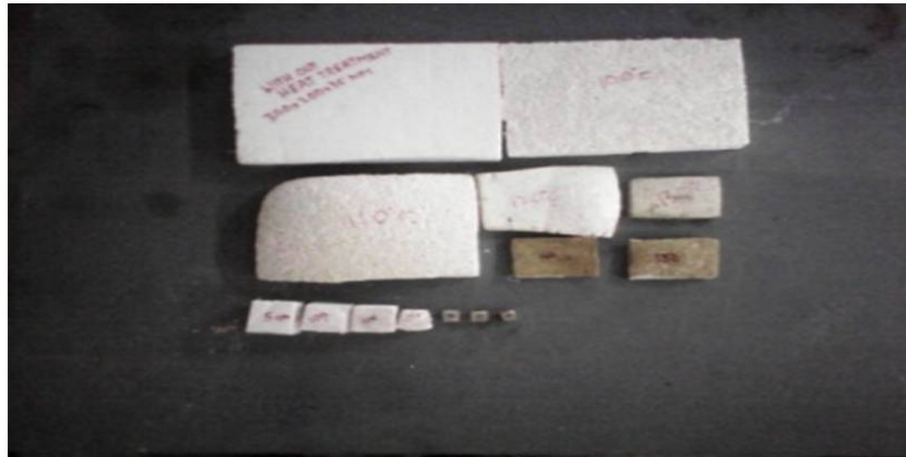
Figure: 4 Deformed Shapes of Plate Section & Cubic Specimens.