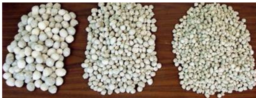
Figure 5: 20 mm, 12.5 mm, 10 mm MEPS coarse aggregate