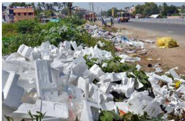
Figure 1: waste EPS dumped on a highway road side

Thermocol is a commercial name of Expanded polystyrene (EPS). In 1951 the researchers of a German company named BASF successfully restructured chemical bonding of polystyrene (a synthetic petroleum product) molecules and developed a substance named stretch polystyrene. This substance was named Thermocol, which nowadays is manufactured through a simple process. Thermoplastic granules are expanded through application of steam and air. Expanded granules become much larger in size but remain very light. Thermocol is a good resister of cold and heat but since it is a petroleum product it dissolves in any solvent of petroleum. The lightweight of this product is largely attributed to a relatively high proportion of semi-closed pores which can account for up to 90 % of the particle volume. The porous structure of loose expanded polystyrene granulates is composite and formed by the voids between individual grains and by the air-filled opening in the grain base. The expansion occurring in the ceramic body is caused by steam and gases, forming at different temperatures, which for various reasons are unable to escape from the body. In this experimental investigation, Thermocol waste was used as a specimen which are modified by Heat Treatment Method and the effects of polystyrene aggregate properties and level of temperature on the physical and micro-structural properties of EPS granules were examined.