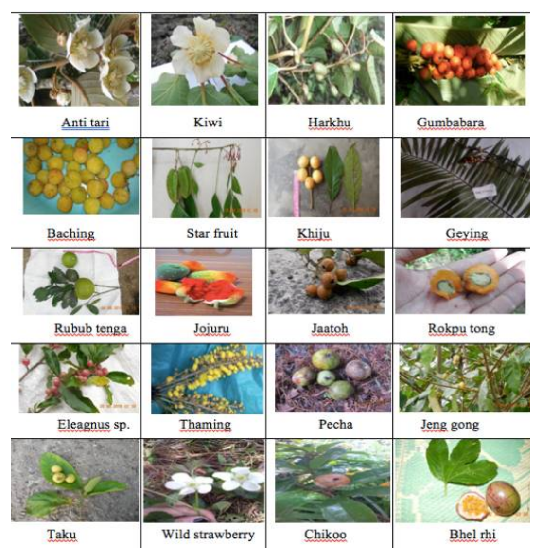
Figure 3: Photos of some of the collected wild fruits from Arunachal Pradesh

Website: <u>www.ijirset.com</u> Vol. 6, Issue 6, June 2017