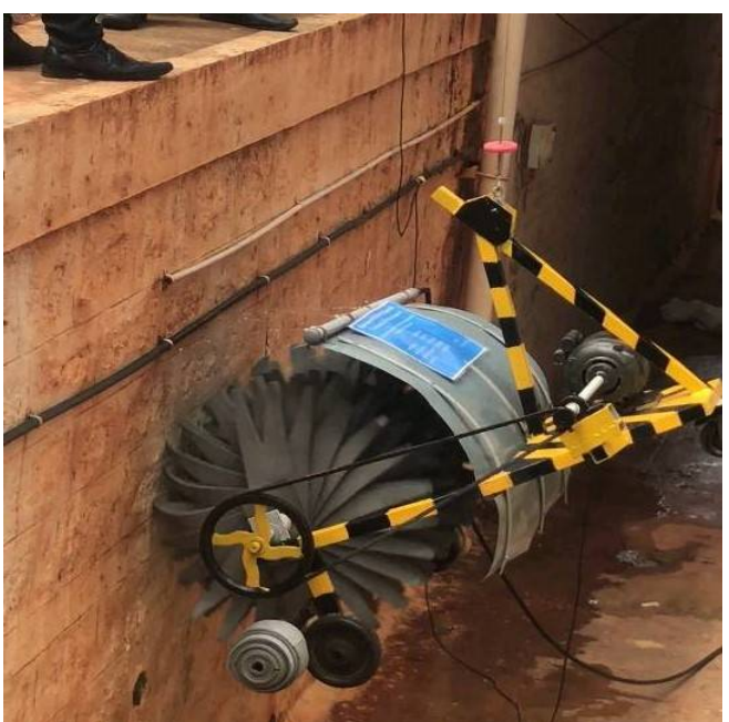
Figure 6 Façade cleaning in progress

The wheels for the wheel assemblies can be any suitable design. Quick pins can be used to allow for quick assembly or disassembly or adjustment of the various rigging components. The winch used for outrigger is preferably an electrically powered winch with a suitable weigh rating given the weigh if the cleaning mechanism used.