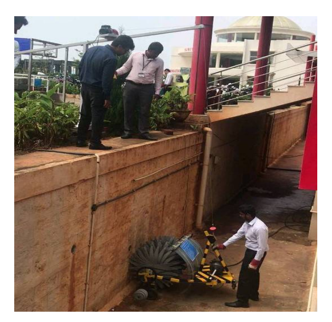
Figure 5 Rolling outrigger along with frame assembly

(An ISO 3297: 2007 Certified Organization) Website: <u>www.ijirset.com</u> Vol. 6, Issue 6, June 2017