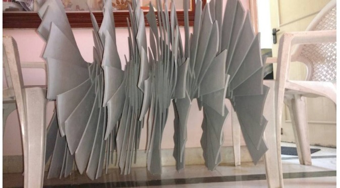
Figure 3 EVA foam brush before profile cutting

(An ISO 3297: 2007 Certified Organization) Website: <u>www.ijirset.com</u> Vol. 6, Issue 6, June 2017