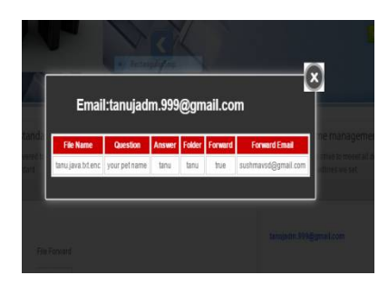
Fig 5.4 Details of file

This figure shows the registration module for new user who needs to register before performing operations on cloud.