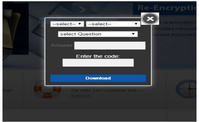
Fig 5.6 Download of key file

This figure shows the download of the file key which is used for the decryption of the file downloaded