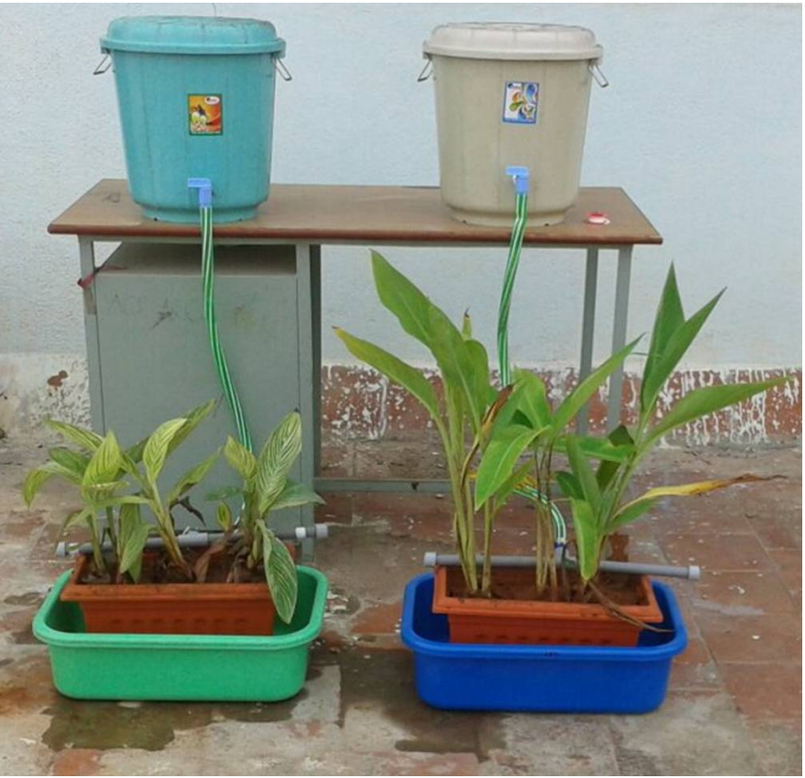
Figure 1- Experimental Setup

The experiment was carried out from July 2016 to September 2016 and two pilot scale units were fed with fresh water for a period of one month. The untreated wastewater from campus were collected and analysed for various parameters. Then the greywater is allowed to flow over the canna plant bed for its treatment. The greywater is fed over the plant and the water collected after treatment is taken for tests such BOD,COD and TSS.