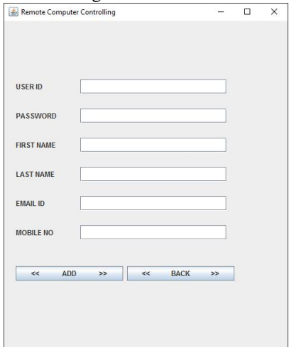
Figure 1: Registration Form for Cloud

Whenever a cloud wants to access a facility from cloud server it entails a "Ticket" before it will decency client request. Only on the foundation of that ticket the cloud server will grant access to all the subscribed service to client. This ticket proves client's confirmation to server. This removes overhead of cloud server for execution verification orders and also protectscloud's dispensation and memory. To get ticket client first request authentication from the Authentication Server (AS). The AS created by "session key" (which is also an encoded key) basing on client's encrypted password and an arbitrary value that signifies the required service. The session key is effectively used a "Knowledge Base Verification System "that will be used by the user to get chief ticket to access facility.