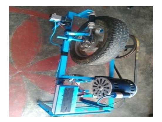
Fig 3.1 Experimental Setup

The IR Transmitter circuit is to transmit the Infra-Red rays. If any obstacle is there in a path, the Infra-Red rays reflected. This reflected Infra-Red rays are received by the receiver circuit is called "IR RECEIVER". The IR receiver circuit receives the reflected IR rays and giving the control signal to the control circuit.