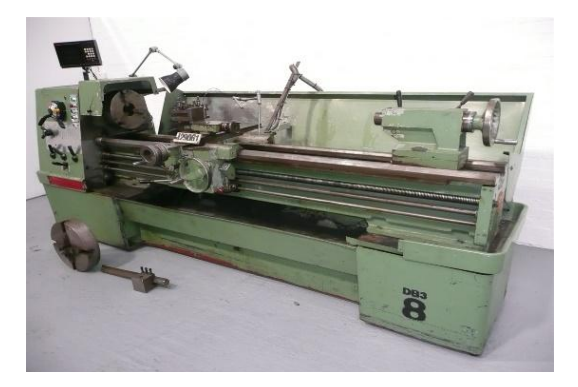
Figure1. Lathe Machine setup

Website: <u>www.ijirset.com</u> Vol. 6, Issue 3, March 2017