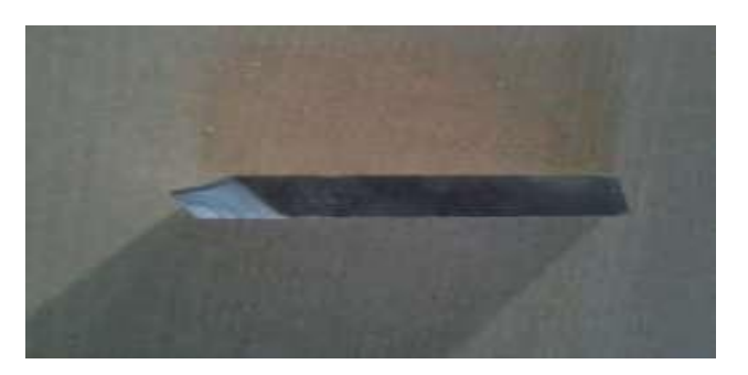
Figure2. cutting tool

Single point carbide tool was used for machining. Photographic view of tool is given below and physical properties of carbide tool are given in table.3