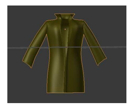
Figure 3 - 3D Mesh

One of the primary goal of a virtual dressing room is to give a realistic visual experience of trying on different garments. Beside the alignment of the clothing, the realism of the clothing movement is an important aspect in providing this experience. Different materials have a different feel to them. For example, silk will move much for freely as compared to leather. In the first versions the clothes were just static 2D images [6]. It was only possible to see how the clothes looked from the front. In more advanced dressing rooms such as the one created by FaceCake multiple 2D images of the clothing from different angles provided a more realistic experience, as it was possible to turn around and have a look from different sides. However, the clothing is still static and there is completely no interaction with the clothes besides changing its location, rotation and scale.Compared to our approach which uses 3D models of clothes designed using Blender [Figure 3], the current approach of using 2D images is limited in several ways. Since the clothing is photographed from a limited number of angles it does not rotate smoothly, but in fixed intervals, while a 3D model can be rotated freely. Furthermore, cloth simulation can be performed on a 3D model making it move and fold as a reaction to the user's movement and thus allowing physical interaction between the virtual clothing and the user avatar, something which is not possible with 2D images.