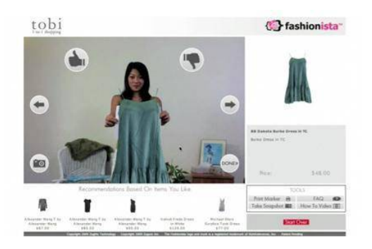
Figure 1 Depth sensing using markers

The first attempt at Virtual Trial Room focused on alignment of the user, rather than its reverse. In this very primitive application, just a fixed static rendering of clothing was displayed on the screen. In order to gain a visual experience of the wearing the garment, the user had to align himself to the clothing image. A more appropriate technique to align the clothing would be to adjust the position, rotation and scale of the garment to the tracked user. With the use of hand-held markers by the user, and combining video tracking and image identification techniques, it was possible to receive some 3D information from RGB images using a normal webcam. Position, rotation and scale were adjusted by moving the marker, as shown in Figure1[4].