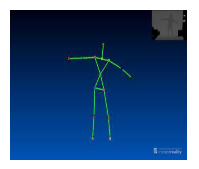
Figure 4 Skeleton Tracking

(An ISO 3297: 2007 Certified Organization) Website: <u>www.ijirset.com</u> Vol. 6, Issue 3, March 2017