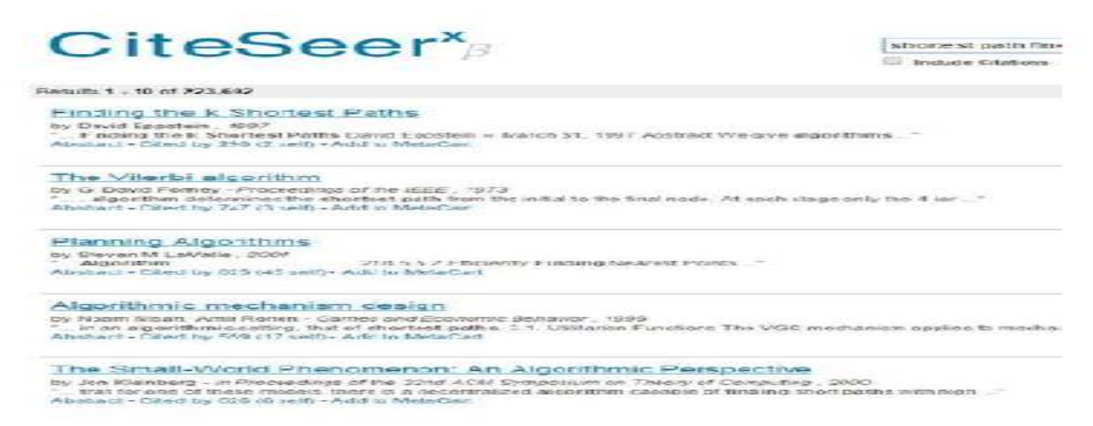
Fig.\ 1.\ Sample\ search\ results\ for\ the\ query\ "shortest\ path\ finding\ algorithm"\ on\ Citeseer X.

CiteSeer is a not only digital library but also search engine for all academic documents. Traditionally, the focus of CiteSeer_ has been on computer science, information science and related disciplines; however, in recent years there has been an expansion to include other academic fields also. The key features of this algorithm_are that it automatically performs information extraction on all documents added to the collection and automatic indexing, which allows for citations and other information among papers to be linked[1].