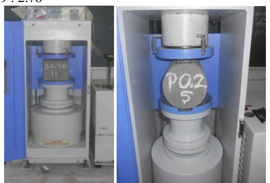
Fig. 1. Experimental Setup

= 394 Kg/m<sup>3</sup> = 743.08 Kg/m<sup>3</sup> = 1090 Kg/m<sup>3</sup> = 197 l/m<sup>3</sup> = 1 : 1.89 : 2.76