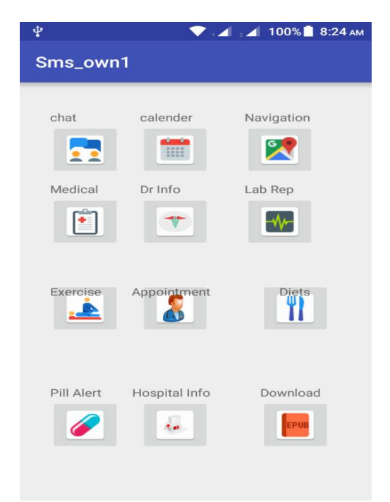
Figure 1.4: U<sup>+</sup> Mobile Application

A partial API design of Doctor patient pre appointment booking app is designed using Android studio as unified tool and Java Xml are GUI and processing languages. SQLite is utilized for low memory fast database applications, which is utilized for putting away Patient Records in Hospital Server.