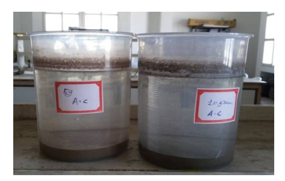
Fig. 8. Wastewater sample treated with Activated carbon

Same way, we prepared two samples of wastewater treated with activated carbon as shown in Fig.8. Then after, two samples were kept as it is for duration of 24 hours as the particles were settle down and at the bottom of container sludge was formed.