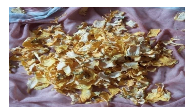
Fig. 3. Sun-dried Pumpkin

First of all the strips were sun dried for two days for the duration of 8 hour a day as shown in Fig.3.