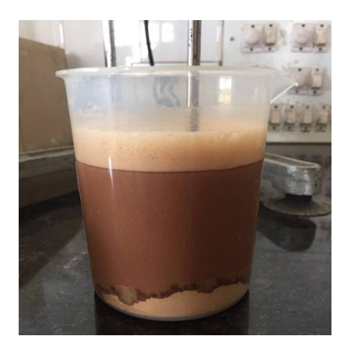
Fig. 7. Wastewater sample mixing by using electric stirrer

First we converted an activated carbon particles into pulverized form. Then after the fine powder of activated carbon was divided into two proportion of 5g & 10g which was added in 500ml of two different sample containing synthetic waste water. Then the samples were mixed by using electric stirrer for 10 minutes.Fig. 7. represents the proper mixing of sample by using electric stirrer.