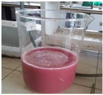
Fig. 1. Synthetic waste water

It was very difficult to arrange the industrial waste water containing heavy metals, so we prepared the synthetic waste water as shown in Fig.1.