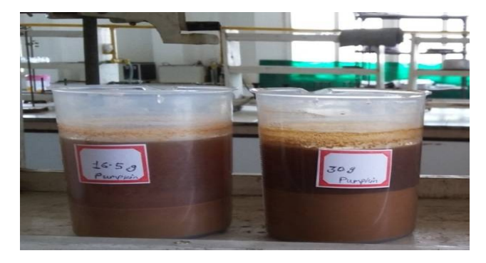
Fig. 6. Wastewater sample treated with Pumpkin Powder

Further, 48 grams of pumpkin powder was divided into two proportions of 16.5g & 30g and were mixed thoroughly in containers containing 500ml of waste water. So we got two samples of wastewater treated with pumpkin powder as shown in Fig.6. Then the samples were mixed by using stirrer for 10 minutes. After that, samples were kept as it is for 24 hours, to let settle down the particles and at the end, sludge was formed at bottom of the containers.