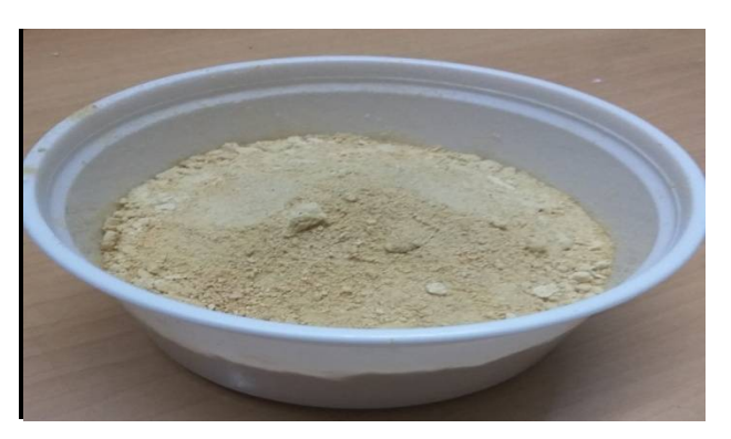
Fig. 5. Pulverized Pumpkin Powder

There after pumpkin strips were pulverized into a fine powder in a blender, so we obtained pulverized pumpkin powder about 208 gram as shown in Fig.5. Then after the pumpkin powder was sieved using a 75 µm sieve and we observed 48 gram homogeneous pumpkin mixture was able to pass through it.