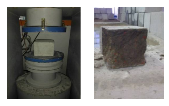
(a) (b) Fig 4: (a). Compression testing of specimen, (b). Crack pattern of specimen.

Compression testing machine have maximum capacity of 2000 kN and the rate of loading is 2.3 kN/second. The specimen is tested after 7 day and 28 day on compression testing machine, and the reading is noted. Diving the load by area gives the compressive strength or we can directly note the compressive strength. The figure below shows the compression testing and crack pattern. Figure 4.(a) shows the testing of specimen in compression testing machine and figure 4(b) shows the crack pattern of specimen.