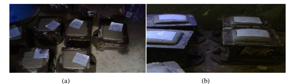
Fig.3.(a) Concrete during hydrogen evolution process. (b) Concrete after setting.