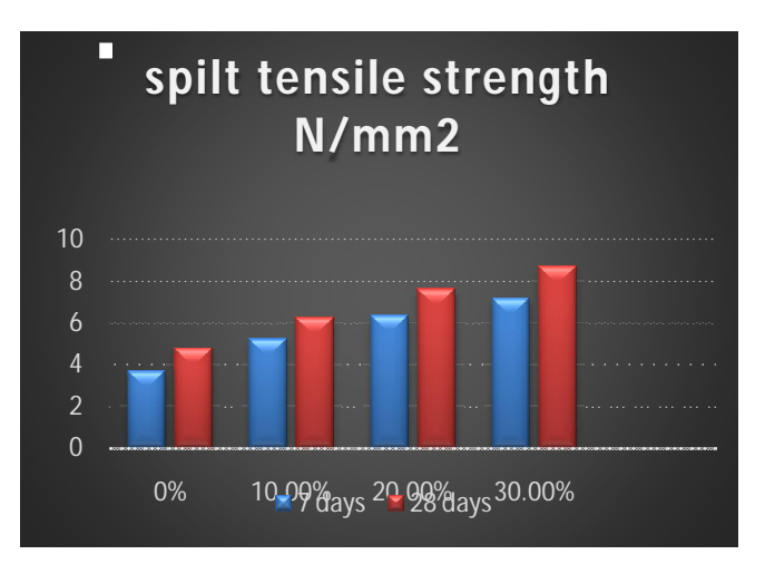
Fig: 2 SPILT TENSILE STRENGTH