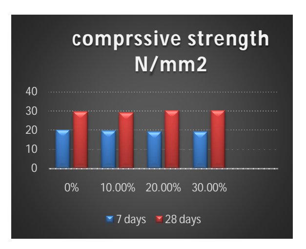
Fig 1: COMPRESSIVE STRENGTH