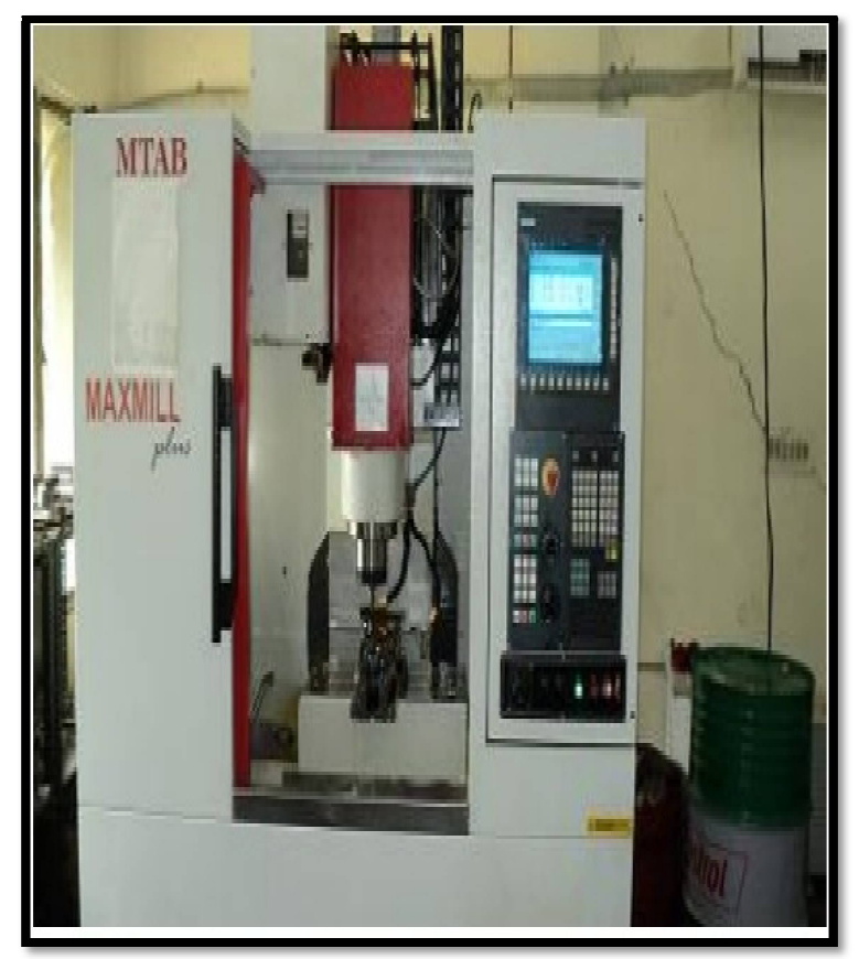
CNC milling machine

DEPTH OF CUT – 0.2mm, 0.3mm, 0.4mm EXPERIMENTAL PHOTOS