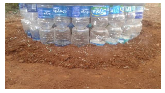
Figure 3: Actual Photographs of Model