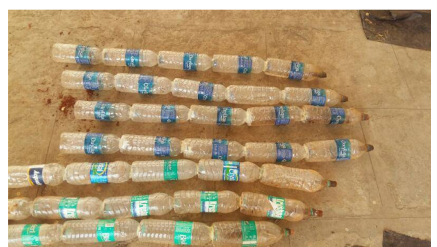
Figure 2: Actual Photograph showing Mud-Cocks Inserted in Bottles.

By taking raw brick mud such cylindrical shaped cocks were made & let them bake at 950°C for 24 hours. After drying it was then inserted into a last bottle of series & made it water tight by applying adhesive. Here after water is filled in bottles its percolation rate will be decreased due to low porosity of mud cocks.