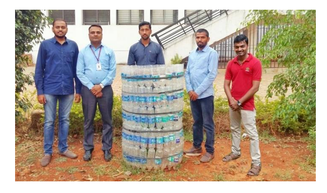
Figure 5: Implementation in the college campus.

(An ISO 3297: 2007 Certified Organization) Website: <u>www.ijirset.com</u> Vol. 6, Issue 5, May 2017