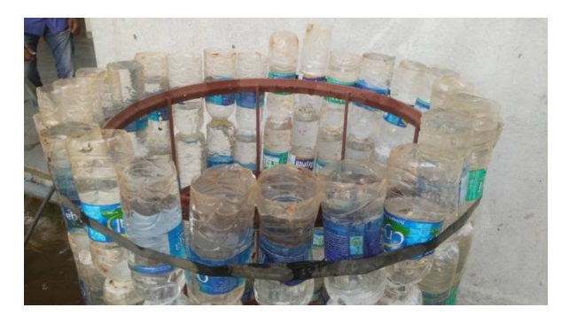
Figure 4: Bottles Full of Water

The last layer of bottles is inserted into ground about 10 to 12 cm to ensure that the water seeps through vertical direction only which in turn results in increase in ground water table.