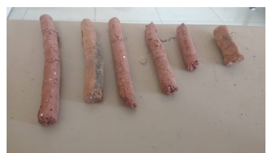
Figure 1: Construction of Brick-Mud Cocks

Interconnecting bottles by making hole at bottom of bottle and inserting another bottle into it, in this way a series of 5 bottles were made. Such 27 series were made to ensure the requirement. Side by side the upper portion of upper layer of bottle is cut down horizontally which makes path to enter rainwater as well as through conventional means. By changing the capacity of bottles (500 ml, 11itre, 2 liters etc) or by modifying the numbers of bottles attached to frame, the total water carrying capacity of safe guard tree can be modified.