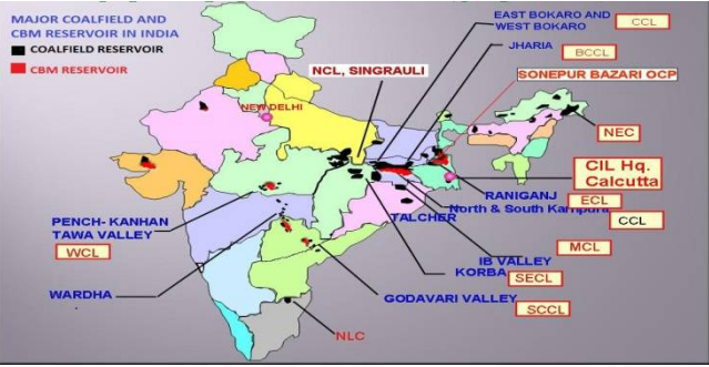
Fig.2Coal and CBM reservoir in Indian state and working company

India having the fourth largest proven coal reserves in the world holds significant prospects for exploitation of CBM. However no assessment about total prognosticated CBM resources in the country including CIL mining lease areas is available. The MoPNG in consultation with Ministry of Coal and CMPDI has identified 26000 sq km of area for CBM operation. Total estimated CBM Resources in this identified area is about 2600 BCM (91.8 TCF). Jharkhand is one of the richest resources of CBM 722.08 BCM (25.5 TCF) [4]. In Jharkhand CBM exploration in high pick due to huge Coal reservoir especially in Jharia block of Dhanbad district.