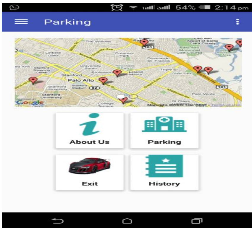
Fig3. Parking distance show on map.